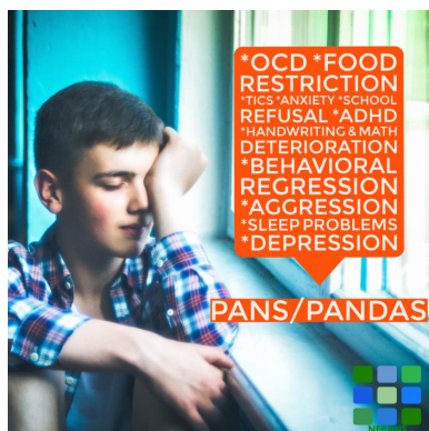
PANS & PANDAS Criteria

Share. Share. Share. Share PANS PANDAS Awareness Day materials on October 9, 2016 and all month long.