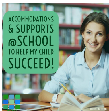
Symptom & Supports