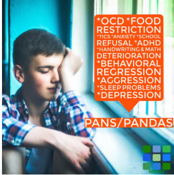
PANS & PANDAS Criteria